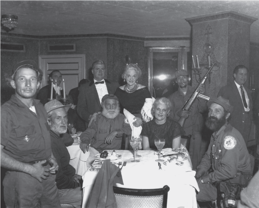
Figure 2.2. Rebels and patricians share a banquet in celebration of Batista's fall.

people interested in?" Castro asked. In unison, the crowd chanted back, " ¡Libertad! ¡Libertad! " Castro spoke about the need for the new government to monopolize all weapons and denounced "elements within a certain organization"—an obvious allusion to the DR, which had amassed an arsenal of its own. Then he asked the audience: "Weapons for what? To fight whom? Against the Revolutionary Government, which has the support of the entire people?" " ¡No! " retorted the multitude as a single voice. White doves appeared on the scene. Two of them landed on the podium, and one perched on Castro's left shoulder (figure 2.3). The throng cheered in amazement; some saw it as supernatural sign of divine approval, perhaps from an afro-Cuban deity. Close, slow-motion examination of the film footage that captured the moment reveals a more earthly explanation: a man standing a few feet from the podium pushed the doves directly toward Castro. 5