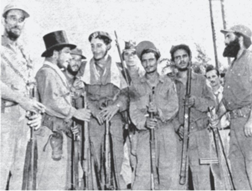
Figure 2.1. Directorio Revolucionario guerrillas wearing assorted headgear.

and in the international arena, as well as its accomplishments and shortcomings. By 1963, almost every aspect of Cuba—including its political system, social structure, foreign relations, trading partners, and cultural production—had been transformed profoundly. This was a period of heroic idealism, of grand social and economic programs, of feverish adventures.