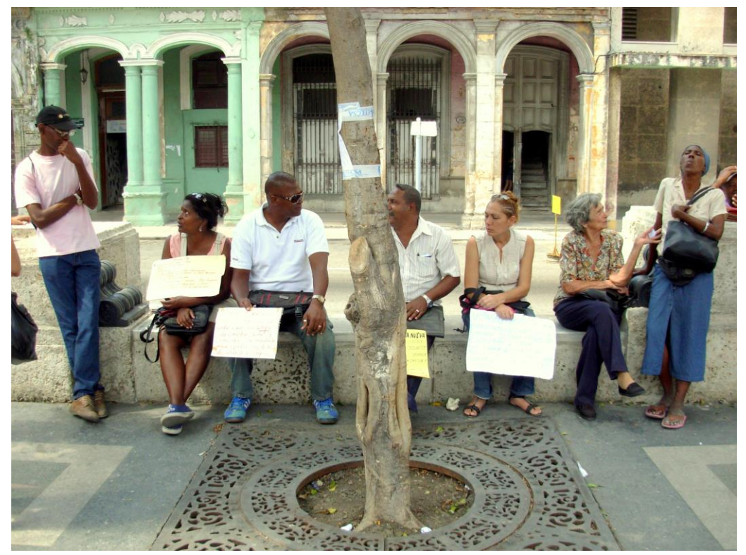
On Havana's Paseo del Prado, sellers and buyers congregate in an informal real estate market.

In this legal framework, to hold a property title to a home meant that one could live in it, improve it (with government permission), pass it to heirs, or swap it for another. Cuba's socialist constitution guarantees personal property rights, specifically the right to "income and savings from one's own work, the housing that one possesses with proper title, and other goods and objects that serve to satisfy the material and cultural needs of the person." But the inability to sell one's house and buy another was a restriction that, seen from any but the socialist viewpoint, drained the property right itself of most of its meaning.