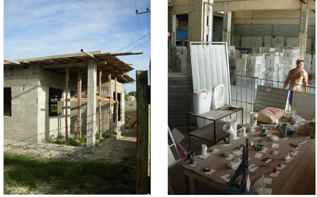
A small house under construction, and a Havana construction materials store.

Building supplies. A half block away from the plumber's new home is a sign of the government's encouragement of do-it-yourself construction and repair: a vacant building turned into a government-operated store that provides the basics for construction and repair: cinder block, particle board, cement, paint, plumbing and electrical supplies, and some tools. The workers have an old Soviet refrigerator in the corner and an old Soviet fan on the front desk. The goods are priced in Cuban pesos, the equivalent of $3.30 for a gallon of latex paint, $10 for 42 kilograms of cement, $14 for 3.5 square meters of particle board, $0.28 for a cinder block, $0.12 for a red brick, $0.80 for a door hinge, $1 for a 40-centimeter square floor tile. In Havana there are 43 building supply centers like this, and 1165 around the country. To encourage sales, prices were reduced across the board in December 2011.